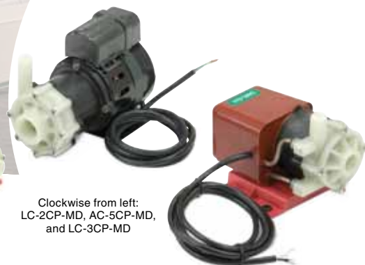
Clockwise from left: LC-2CP-MD, AC-5CP-MD, and LC-3CP-MD

March Marine centrifugal pumps are an excellent choice for providing seawater circulation for marine air conditioning systems. The proven magnetic drive eliminates the troublesome mechanical shaft seal.