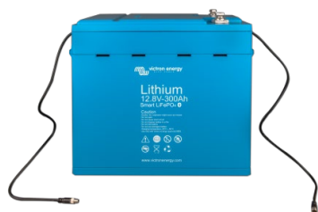
12,8V 300Ah LiFePO4 Battery

Very useful to localize a (potential) problem, such as cell imbalance.